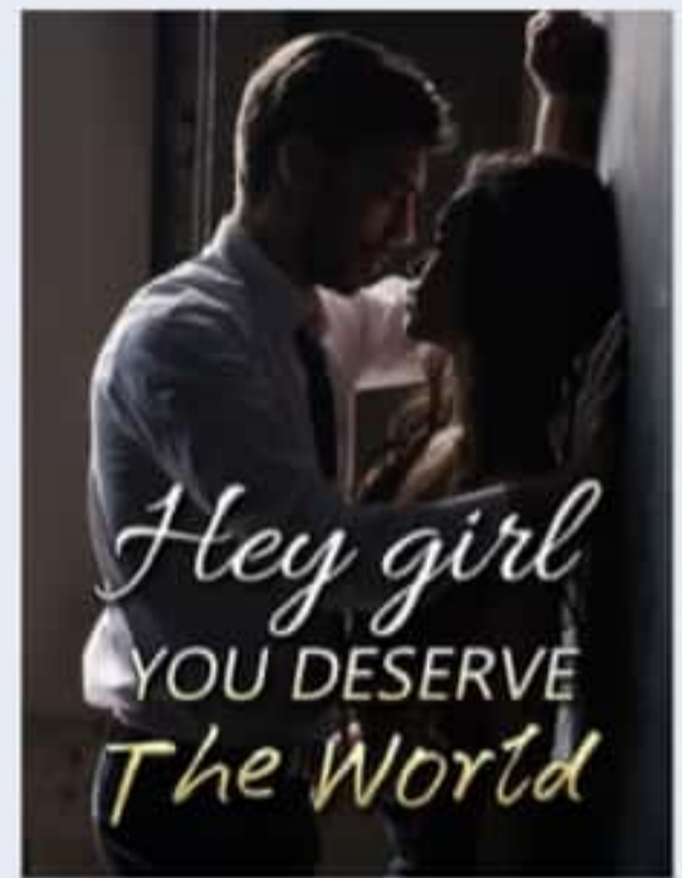
Hey Girl, You...