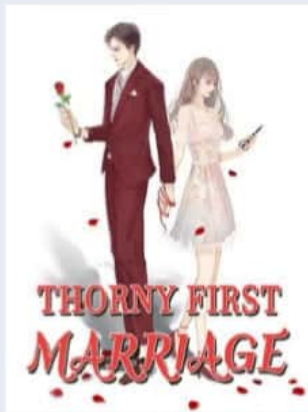
Thorny First ...