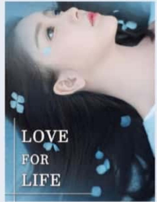
Love for Life