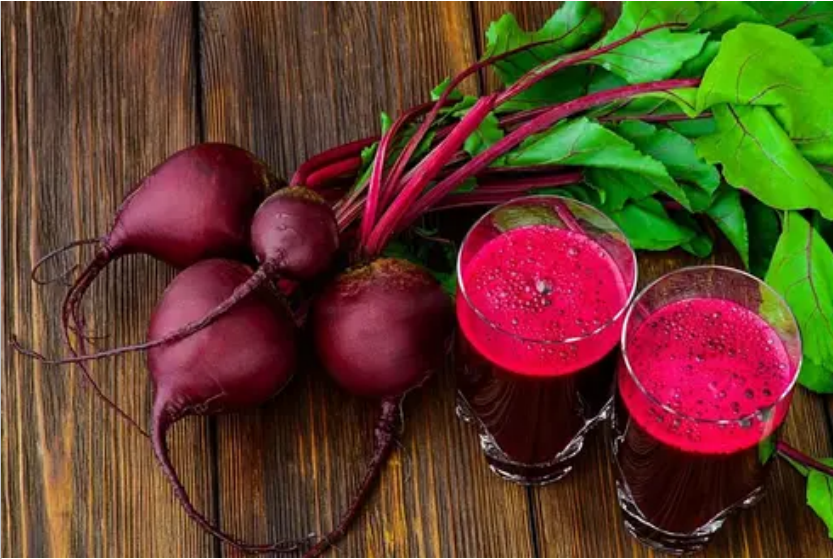
A Home Recipe Cleansing My Blood Vessels! Write It Now