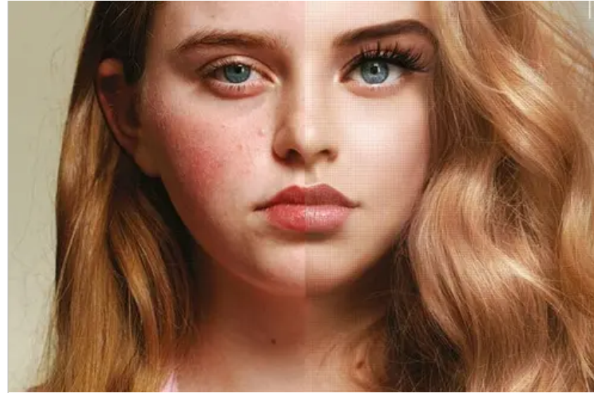
Teens Expose Shocking Reality About Retouching Apps

“Do you really need me to spell that out for you?”