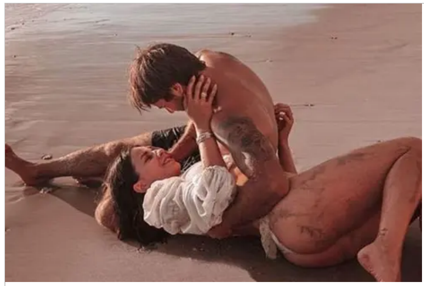
9 Tips To Protect Your Relationship