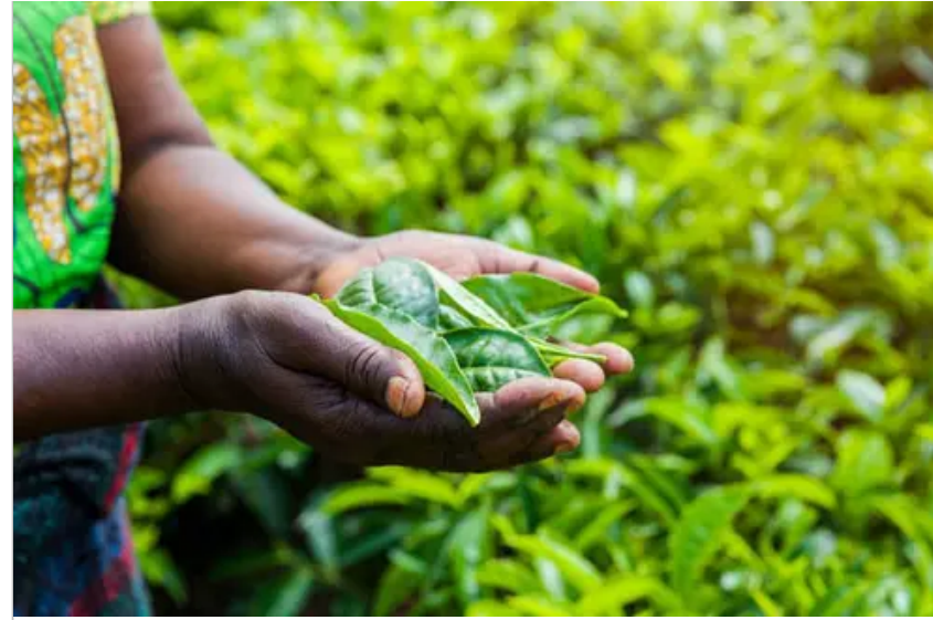
I Don't Get Sick Because I Clean My Blood Vessels. Read More