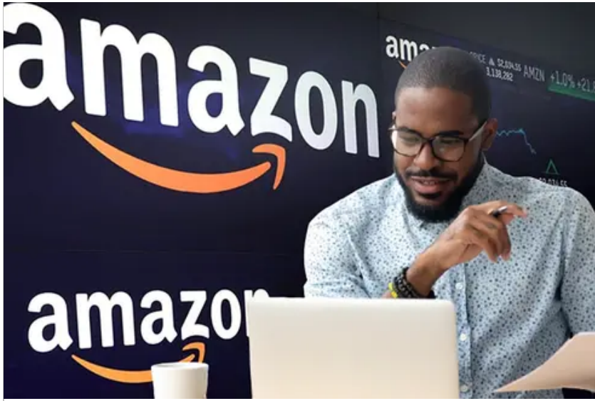
Greater Accra Region: Invest $250 In Amazon To Get $3,539