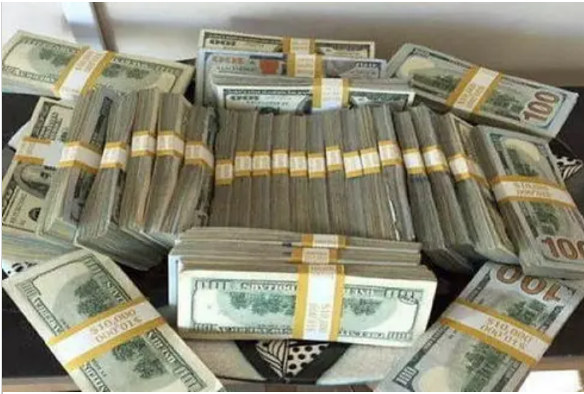
People Earn $2,580 Per Day Doing This