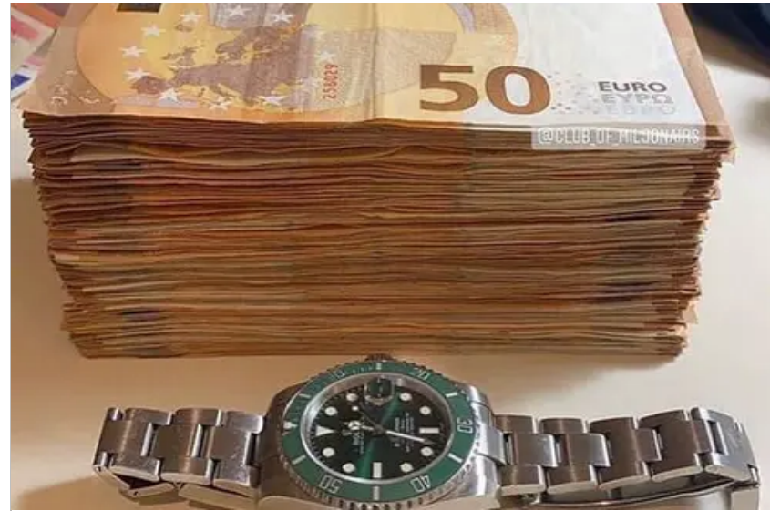
Earn €1467 A Day In Accra Without Leaving Your Home

“If they want a fight, then that’s what they’ll get!”