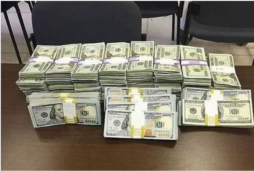
Millionaire Reveals: How To Make Money Working From Home