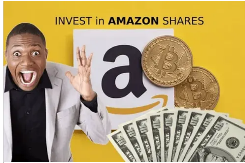
Greater Accra Region: Invest $250 In Amazon To Get $3,539