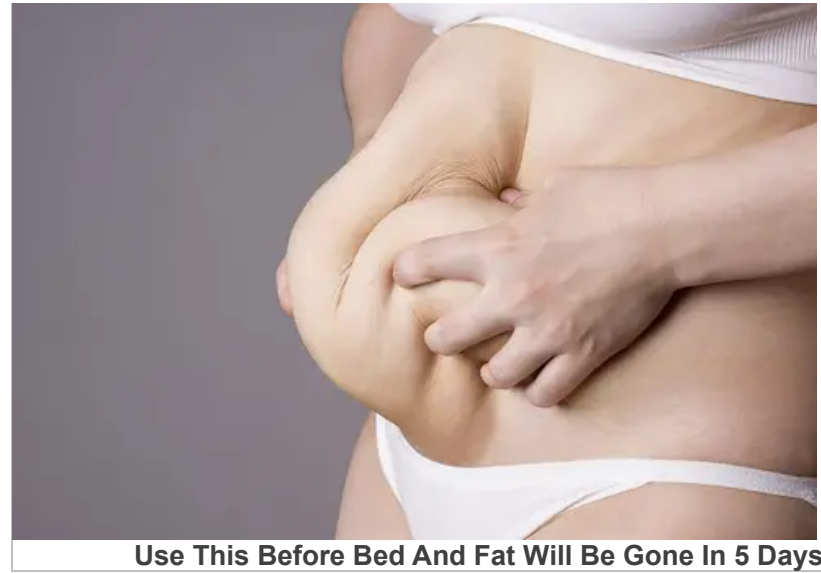
Use This Before Bed And Fat Will Be Gone In 5 Days