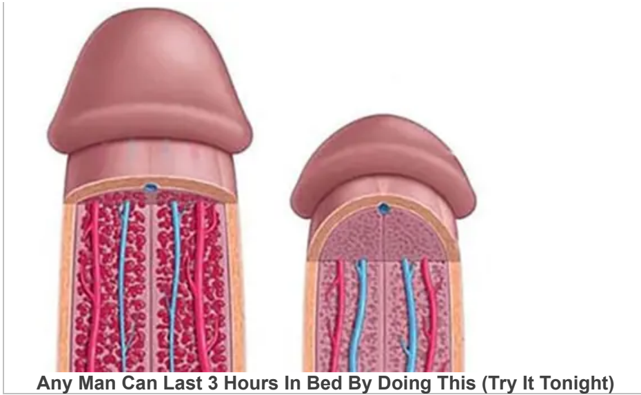
Any Man Can Last 3 Hours In Bed By Doing This (Try It Tonight)